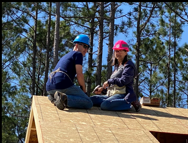
Participated in Habitat for Humanity new home construction in Aberdeen